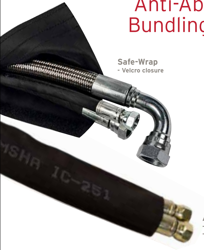
Safe-Wrap - Velcro closure