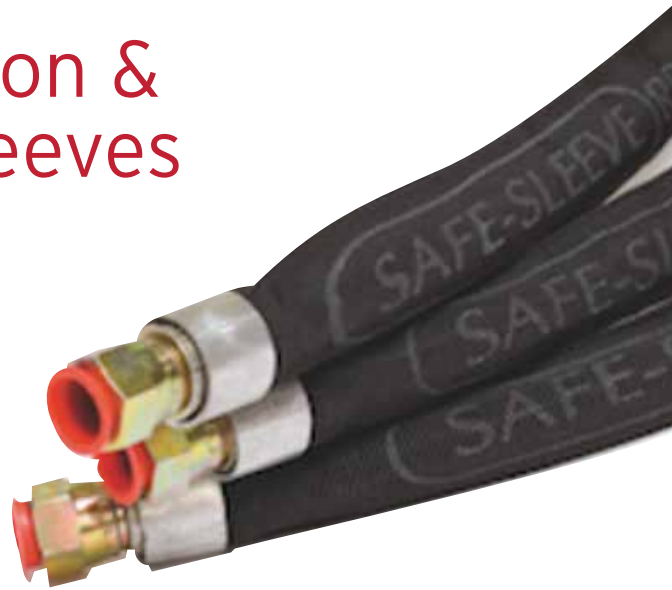
Safe-Sleeve - Durable polyester - MSHA accepted